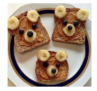
Wheat bread, bananas, peanut butter, blueberries (can use raisins): Cute and healthy!