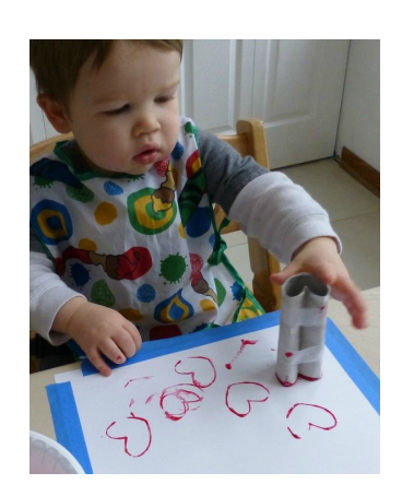
For Valentine's Day; Crease down the length of a toilet paper tube on opposite sides. Push one of the creases inward, and tape to hold the heart shape. Use fingerpaint or tempera..

If there are certain kinds of books or materials you would like me to bring out to you, just call me at: 717-207-0500 ext. 1201, or email: mbenson@lancasterlibraries.org