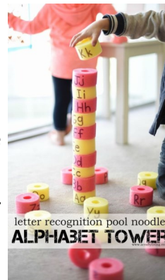
letter recognition pool noodle ALPHABET TOWER

Pool Noodles make great alphabet blocks. They can also be strung on a rope, and roll down ramps.