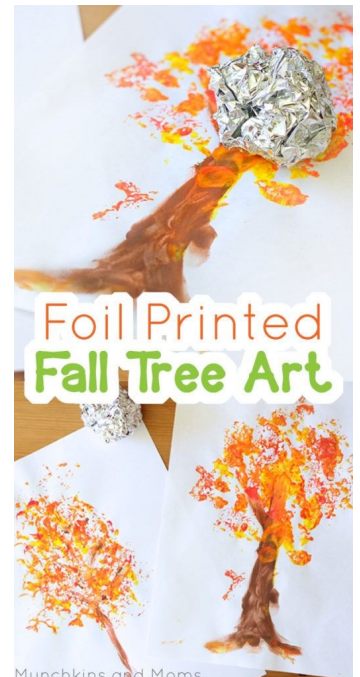
Munchkins and Moms