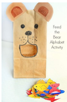
Feed the Bear Alphabet Activity