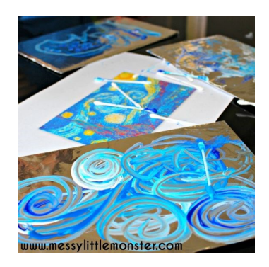
Paint on foil with Q-tips.