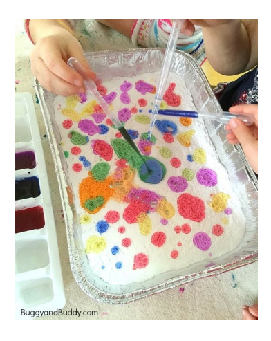
Experiment with Colors; Fill a foil tray with baking soda. Fill an ice cube tray with vinegar. Add liquid watercolors to the vinegar. Use a pipette or eye-dropper to place a few drops of colored vinegar into the baking soda. Watch what happens!