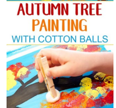
Torn Paper Fall Tree