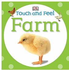
Farm Touch and Feel DK Publishing