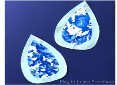
Play to Learn Preschool

Above is another craft to do with your children. (Found on Pinterest)