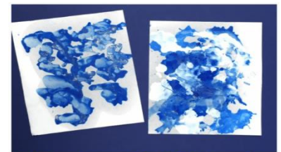
Rain & Wind Process Art