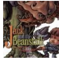
Jack and the Beanstalk by George Bridge

I try to achieve the 6 early literacy skills - Print Motivation, Print Awareness, Letter Knowledge, Vocabulary, Phonological Awareness (such as rhyming words), and Narrative Skills – by including 5 basic activities in my lesson plans: TALK, SING, READ, WRITE, PLAY.