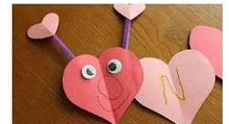
Valentine's Day Love Bug PRESCHOOL NAME CRAFT from the teachers.com