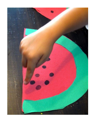
Use red and green construction paper, or half of a paper plate and paint or markers. Use a washable ink stamp pad or paint for fingerprint seeds.

TIP: For a virtual cornucopia of craft ideas, go to www.Pinterest.com