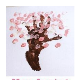
Handprint blossoming cherry tree